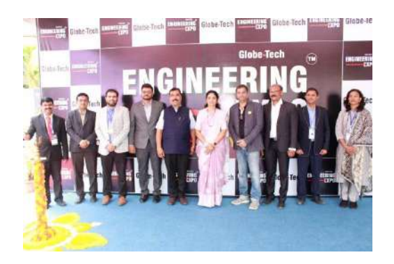
The Chief Guest Exploring the Show to encourage our valued exhibitors.